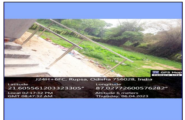
Ramp Facility for Differently Abled Students