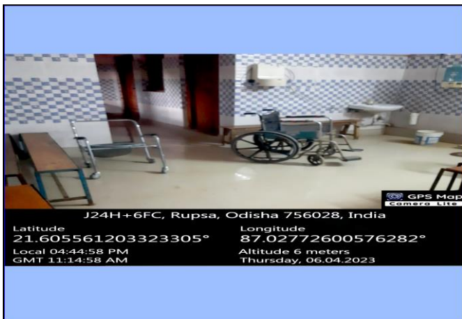
Wheel Chair Facility for Differently Abled Students