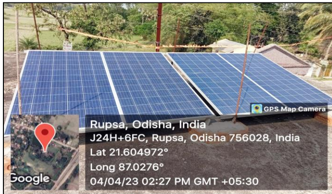
Solar Point as Alternative Sources of Energy