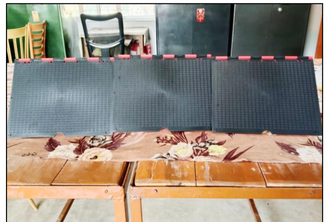
Braille Slate for the Blind