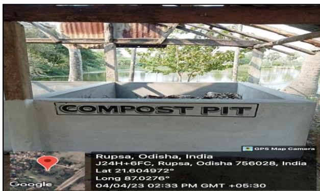
Waste Management Pit